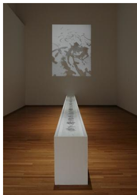
Left: 07 NAKANISHI Natsuyuki, G/Z Summer Solstice – On the Bridge IV , 1993 ©NATSUYUKI NAKANISHI