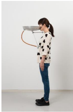
Left: 01 USUI Ryohei, Fence , 2024/2026 [detail]