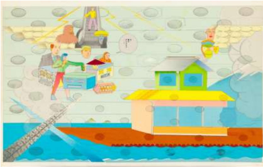
6. YOKOYAMA Yuichi, Don't cheat me , 1997