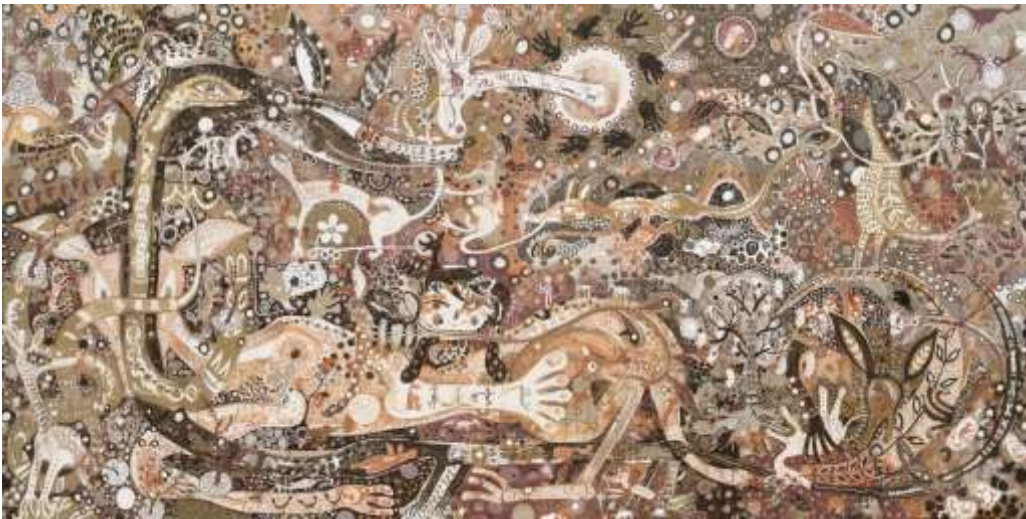
8. ASAI Yusuke, Earth Painting - Bare foot on the Earth , 2011 © Yusuke Asai, courtesy of ANOMALY