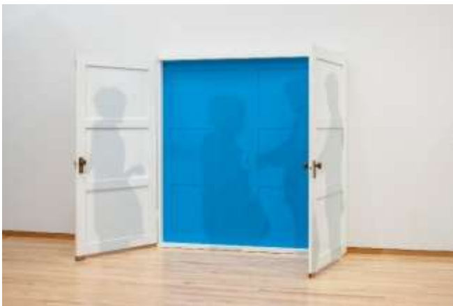
4. TAKAMATSU Jiro, Shadows on the Door , 1968