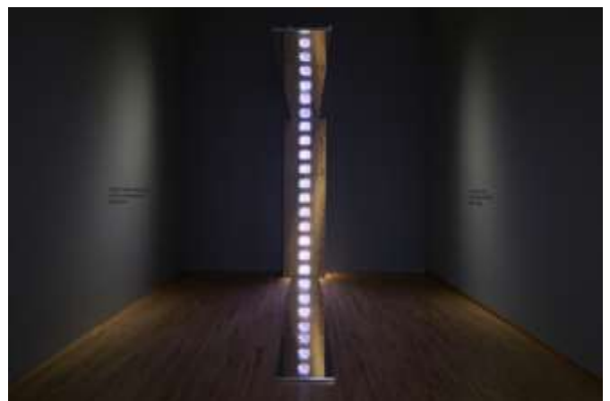
5. KUBOTA Shigeko, Duchampiana: Marcel Duchamp's Grave , 1972-75/2019