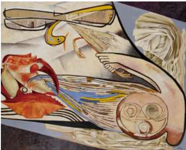
2. KATSURA Yuki, Resistance , 1952