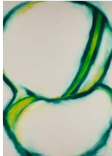
7. MARUYAMA Naofumi, 15kg , 1992