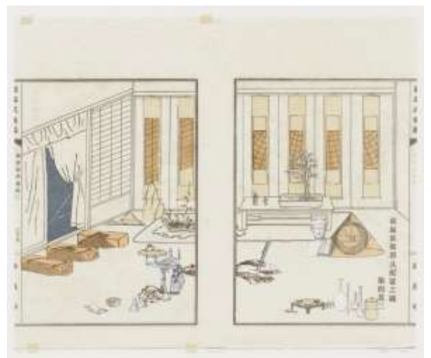
10. KATAOKA Junya + IWATAKE Rie, Room37-Arranged Mountains and Vanishing Point , 2018