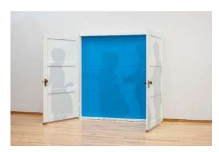
4. TAKAMATSU Jiro, Shadows on the Door , 1968 Photo: Masaru Yanagiba ©The Estate of Jiro Takamatsu, Courtesy of Yumiko Chiba Associates