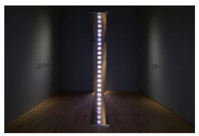
5. KUBOTA Shigeko, Duchampiana: Marcel Duchamp's Grave , 1972-75/2019