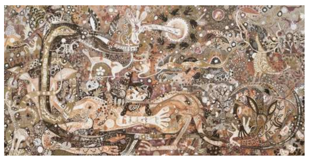
8. ASAI Yusuke, Earth Painting - Bare foot on the Earth, 2011 © Yusuke Asai, courtesy of ANOMALY