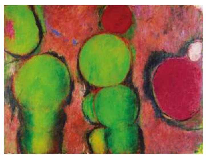
6. TATSUNO Toeko, UNTITLED 90-14 , 1990