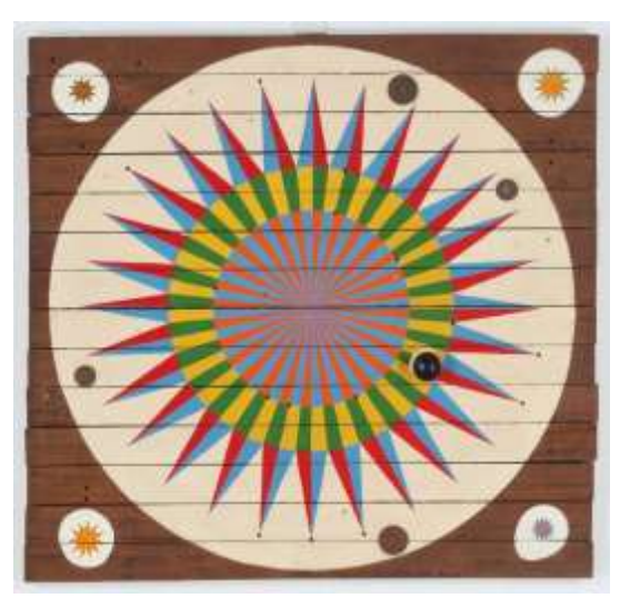
3. KIKUHATA Mokuma, Roulette, 1963