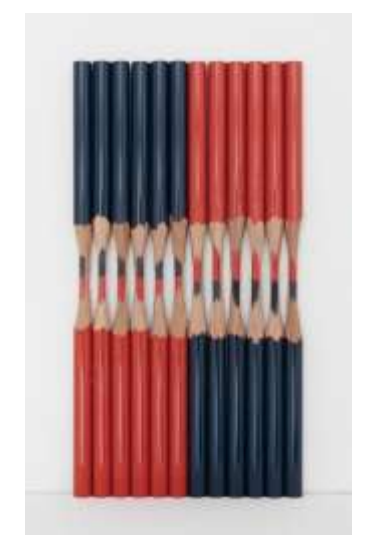
7. TOYOSHIMA Yasuko , Pencil , 1996-98