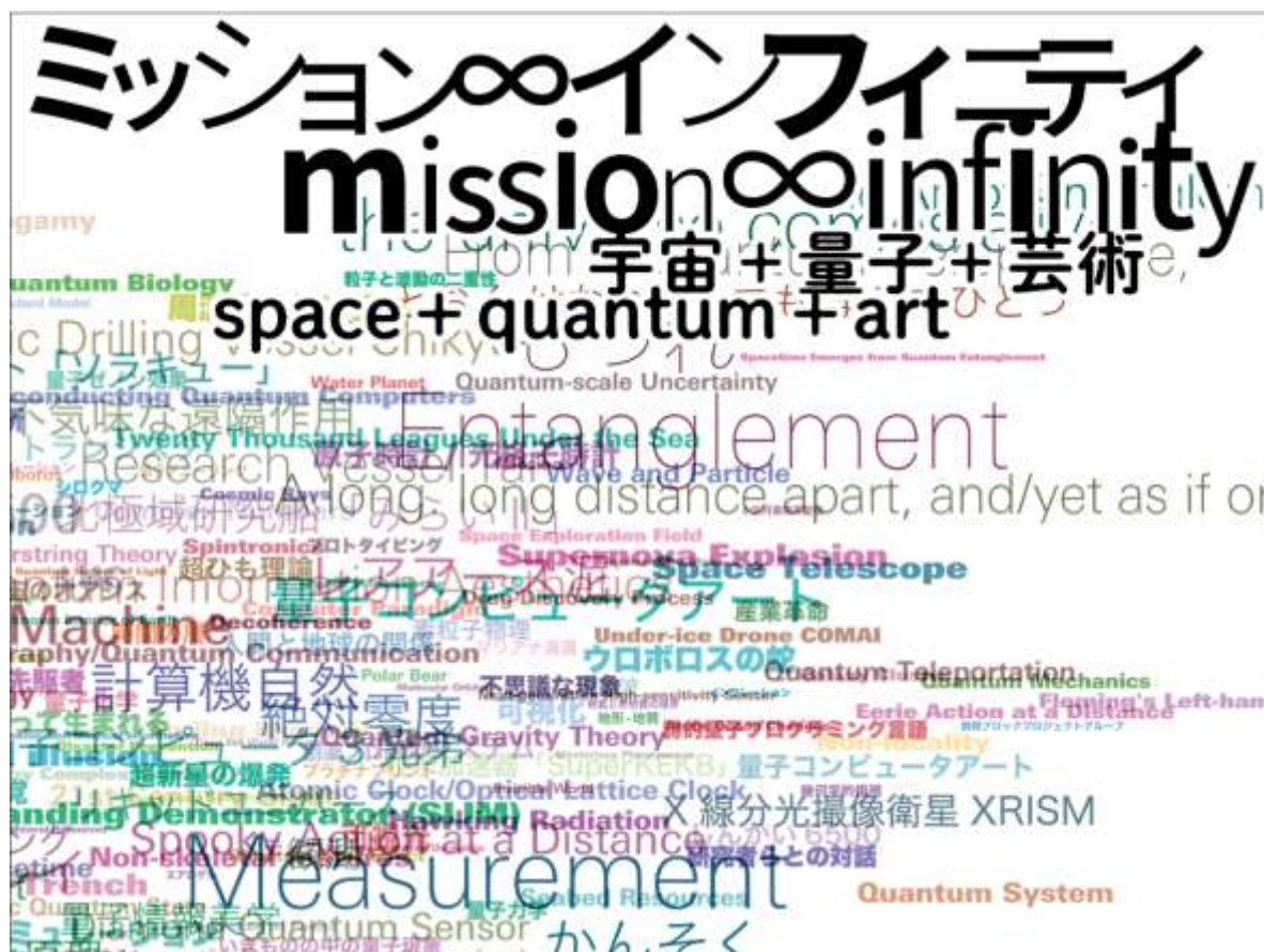
Ten years after the "Mission [Space x Art]" at the Museum of Contemporary Art Tokyo, in conjunction with the International Year of Quantum Science and Technology (2025), this special exhibition explores the origins of the world and the invisible world through a collaboration between art and areas of science including space and quantum. In addition to space research by scientists and space-oriented works by artists, this exhibition will also feature the first artwork created using a Japanese quantum computer, showcasing new possibilities for expression in the quantum realm, where time and space exhibit mysterious behaviors. Art has always played an important role in exploring beyond boundaries. As space travel becomes more common and quantum research heads into the next century, this exhibition of diverse installations and XR exhibits will explore the efforts of creators following the trials of pioneers to expand the realm of expression. Through talk events held throughout the exhibition, including dialogues between researchers and artists, visitors can explore their own "quantum-native" creative ideas.