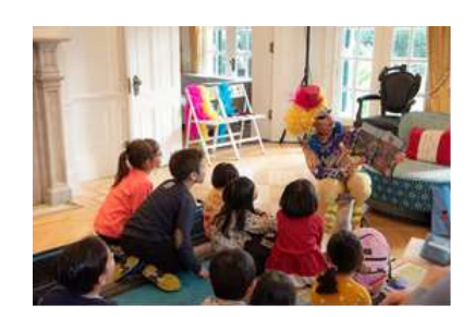
Drag Queen Story Hour *This photograph is for reference only.

* Please check the MOT's website for up-to-date information related to the exhibition.