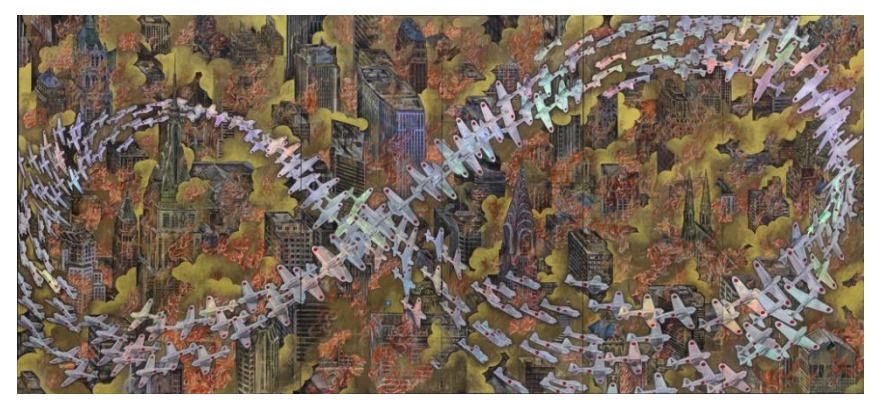
AIDA Makoto, A Picture of an Air-Raid on New York City (War Picture Returns) , 1996, 174 × 382cm CG of Zero fighters created by MATSUHASHI Mutsuo photo: MIYAJIMA Kei © AIDA Makoto Courtesy of Mizuma Art Gallery