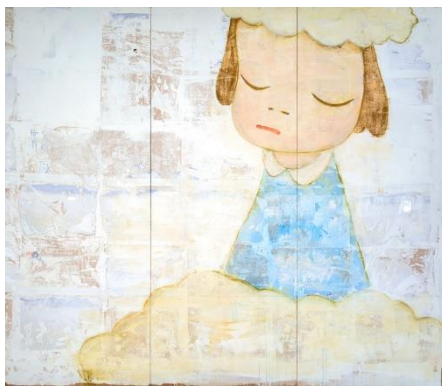
NARA Yoshitomo, Untitled , 1999, 240 × 276cm © NARA Yoshitomo, courtesy of Yoshitomo Nara Foundation