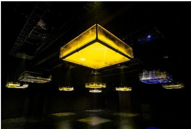
03 Ryuichi Sakamoto + Shiro Takatani, LIFE–fluid, invisible, inaudible... , 2007/2023, installation view of “Ryuichi Sakamoto | SOUND AND TIME” at M WOODS (People’s park), Chengdu, 2023