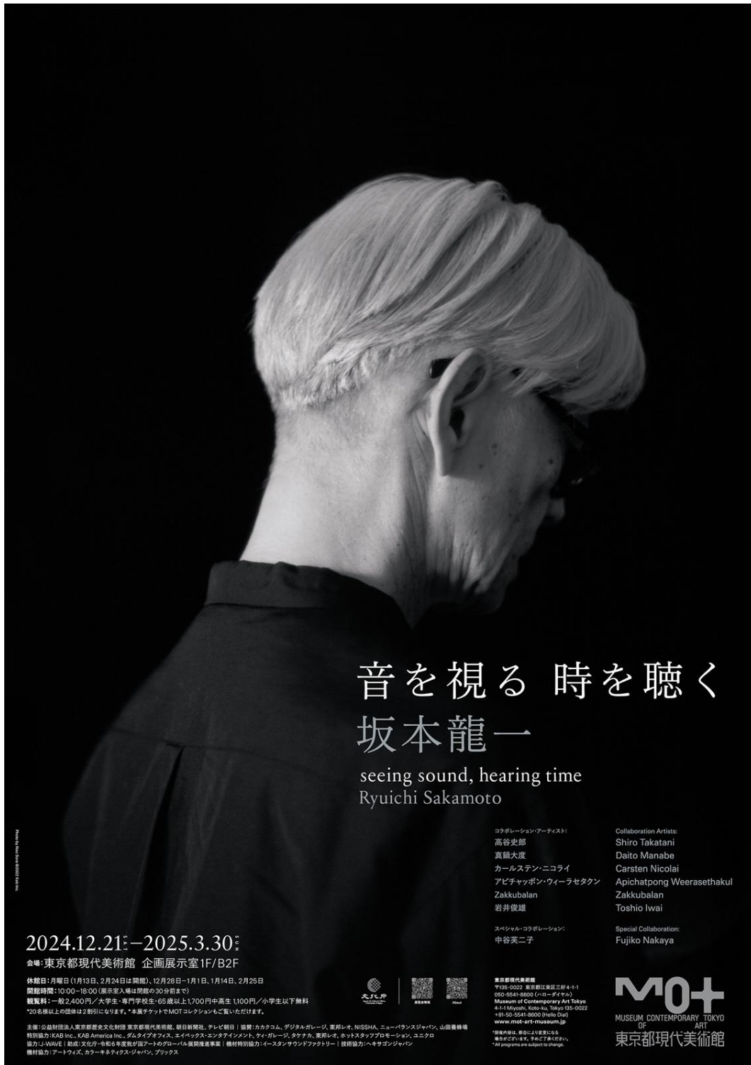
01 Ryuichi Sakamoto | seeing sound, hearing time – Exhibition Poster

Contact Museum of Contemporary Art Tokyo Public Relations / Kudo, Inaba, Uchibori, Nogawa E-MAIL: mot-pr@mot-art.jp TEL: +81-3-5245-1134 https://www.mot-art-museum.jp/en * All Programs are subject to change.