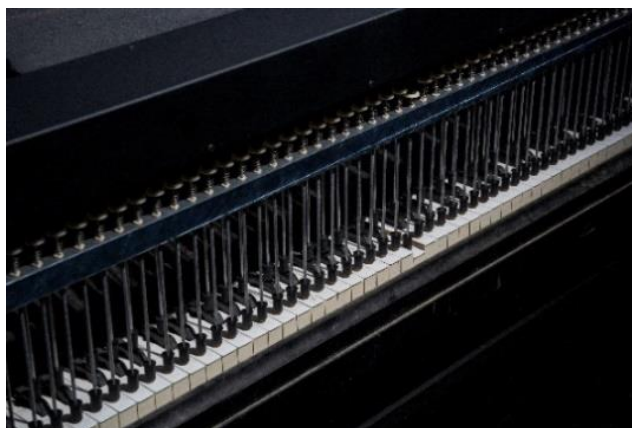
02 Ryuichi Sakamoto with Shiro Takatani, IS YOUR TIME , 2017/2023, installation view of "Ryuichi Sakamoto | SOUND AND TIME" at M WOODS (People's park), Chengdu, 2023

Carsten Nicolai, PHOSPHENES, ENDO EXO , 2024 Music: Ryuichi Sakamoto