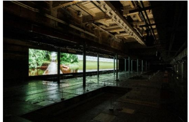
04 Ryuichi Sakamoto + Shiro Takatani, async–immersion 2023, 2023, installation view of “AMBIENT KYOTO 2023”, Kyoto Shimbun Building B1 floor, 2023.